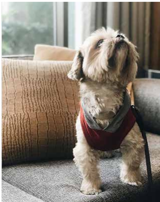
CALIFORNIA VIBE: Four-legged guests enjoying their stay at Bardessono (above) and Hotel Palomar Los Angeles – Beverly Hills (left)

PHOTOS: © BARDESSONO, © HOTEL PALOMAR LOS ANGELES – BEVERLY HILLS